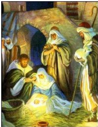
Shepherds give Gifts

The shepherds wanted to go and see the baby. When they arrived at the stable, they were filled with joy at seeing Jesus lying in the manger. They knelt down and worshipped Him. They told Mary and Joseph how the angel had appeared in the sky and told them that Jesus was to be the Saviour of the world.