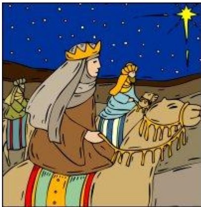
Wise Men Follow the Star

The Wise Men decided to find this new ruler. They went to Jerusalem to see King Herod, as they thought the baby would be in the palace. They asked to see the child that would be King of the Jews. The king was troubled. He thought this new king may take away his throne. He told them to return when they had found the baby so that he could worship the child himself.