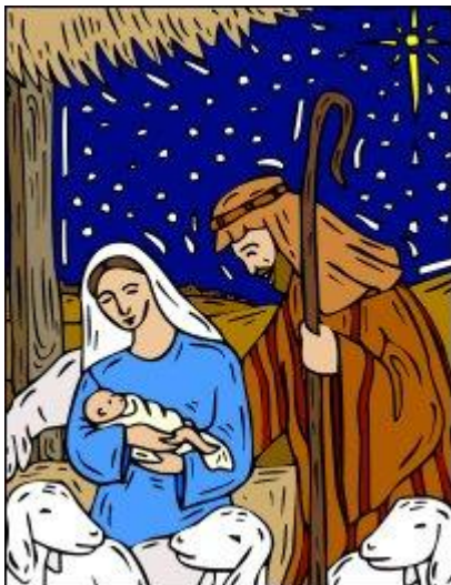
Jesus is Born

And so it was that a few hours later, Mary gave birth to her son in that stable. She wrapped Jesus in strips of cloth and laid Him in a manger full of hay.