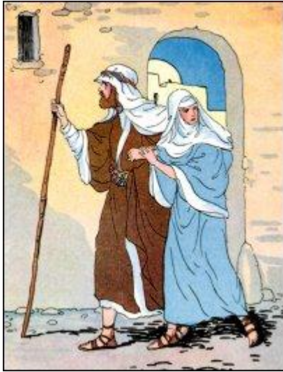
No Room at the Inn

At last Mary and Joseph arrived in Bethlehem. It was crowded with other people who needed to pay their taxes. Mary was very tired and needed a place to stay. At each inn, the story was the same. There was no room for them. Eventually, one kind innkeeper said he had a stable where he kept his animals. They were welcome to stay there.