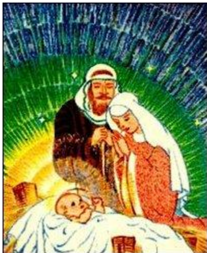
Jesus is Safe

The Wise Men went back to their own country without calling to see Herod. Soon after Joseph had a dream where an angel told him to take Mary and Jesus to Egypt as King Herod had ordered that Jesus be killed. They left Bethlehem right away. When the wise men did not return, Herod ordered that baby boys in Bethlehem be killed. They did not find Jesus as he was safe.