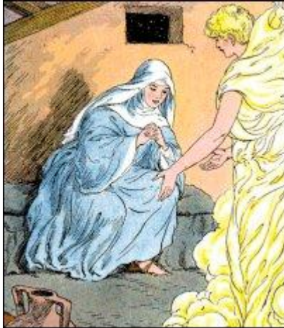
Angel Gabriel appears

About two thousand years ago, in the town of Nazareth, there lived a young woman named Mary. She was engaged to be married to Joseph, a carpenter. One day an angel appeared before her and told her she had been chosen to have a special baby. The baby would be God's son and she must call him Jesus.