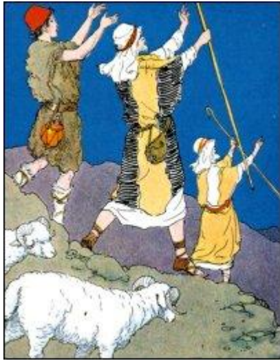
Shepherds are Afraid

At the same time, on a hillside overlooking Bethlehem, some shepherds were watching over their sheep. A bright light appeared in the sky. They were very afraid. It was an angel sent by God. The angel told them not to be afraid, because he had some good news. He said the Son of God had been born and they would find Him in Bethlehem