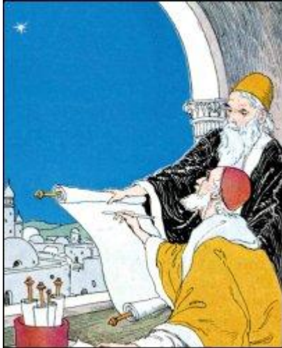
A New Star in the Sky

Far away in the East, Wise Men saw a new star shining high in the sky. These men studied the stars and they knew this was a very special star. They studied their scrolls where it said that whenever a bright new star appeared it meant that a great ruler had been born.