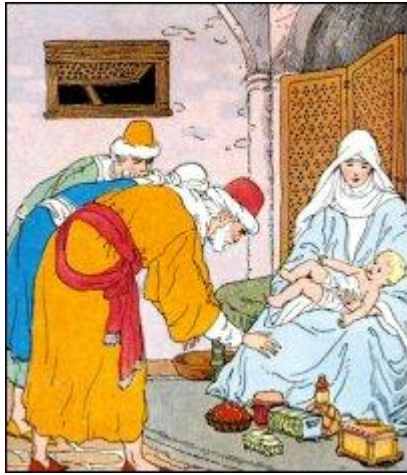
The Wise Men Give Gifts

The Wise Men set off to find the baby. They were guided by the star to the stable in Bethlehem. Here they knelt down and worshipped Jesus. They gave him gifts of gold, frankincense and myrrh. That night, the men had the same dream where an angel warned them that King Herod wanted to kill Jesus and told them not to go back to his palace.